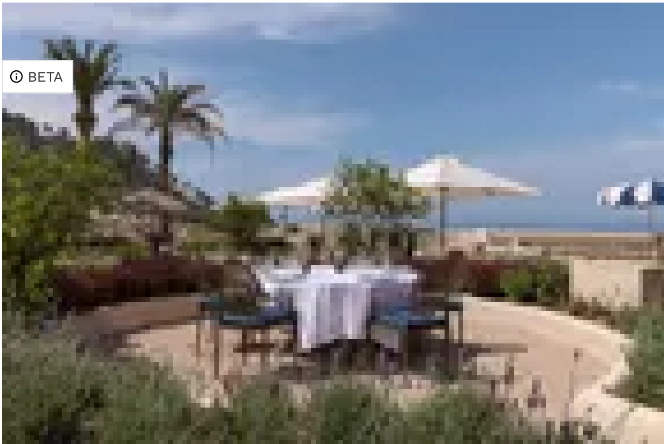
The outdoor terrace at Son Bunyola House & Villas. SON BUNYOLA HOUSE & VILLAS