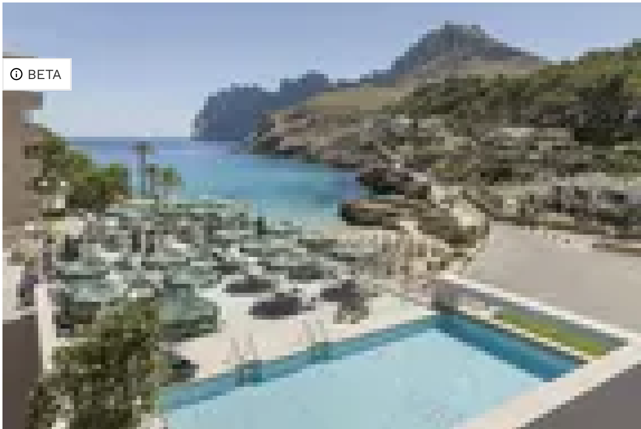
The beachfront view at El Vincenç de la Mar.