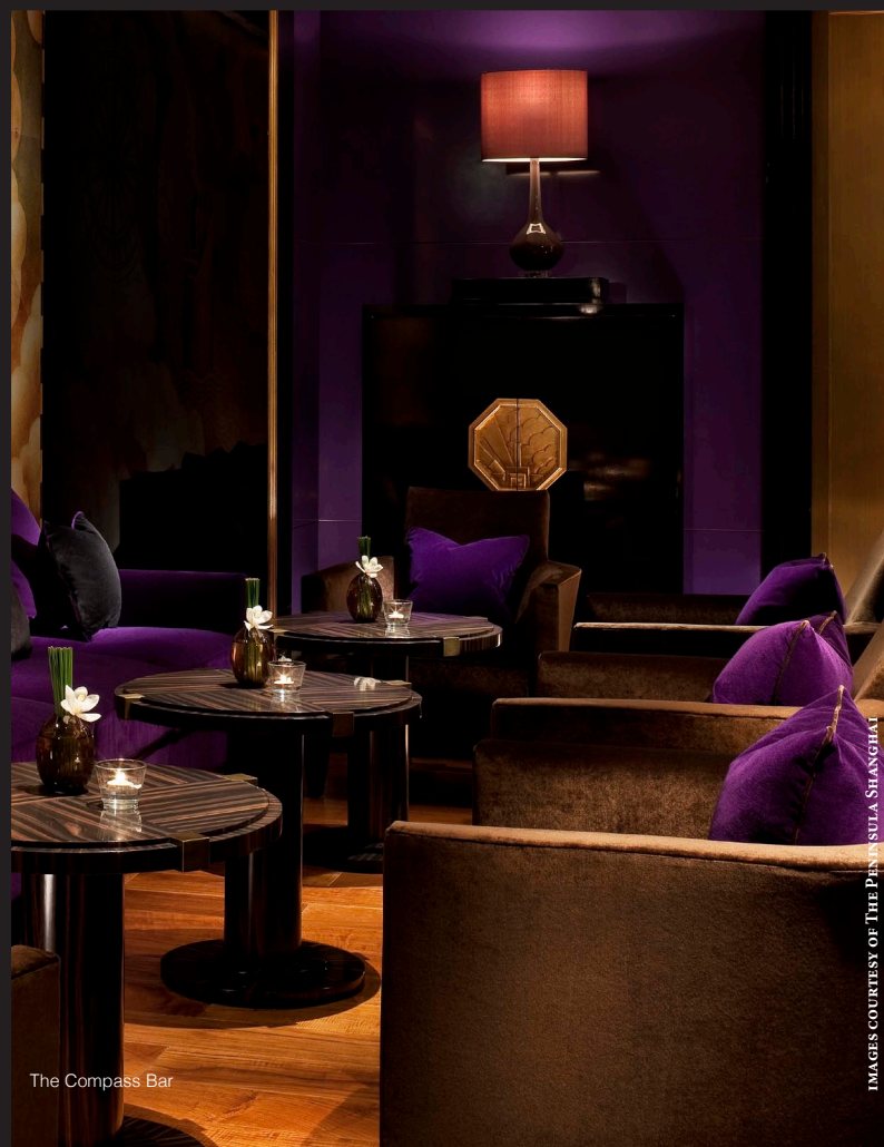
The Compass Bar