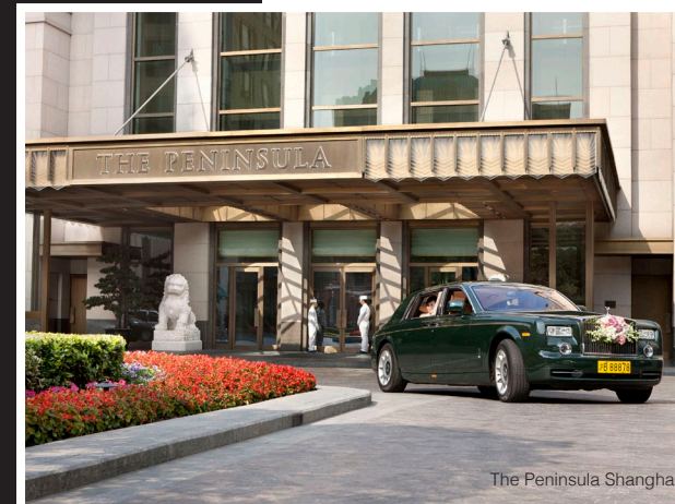
The Peninsula Shanghai