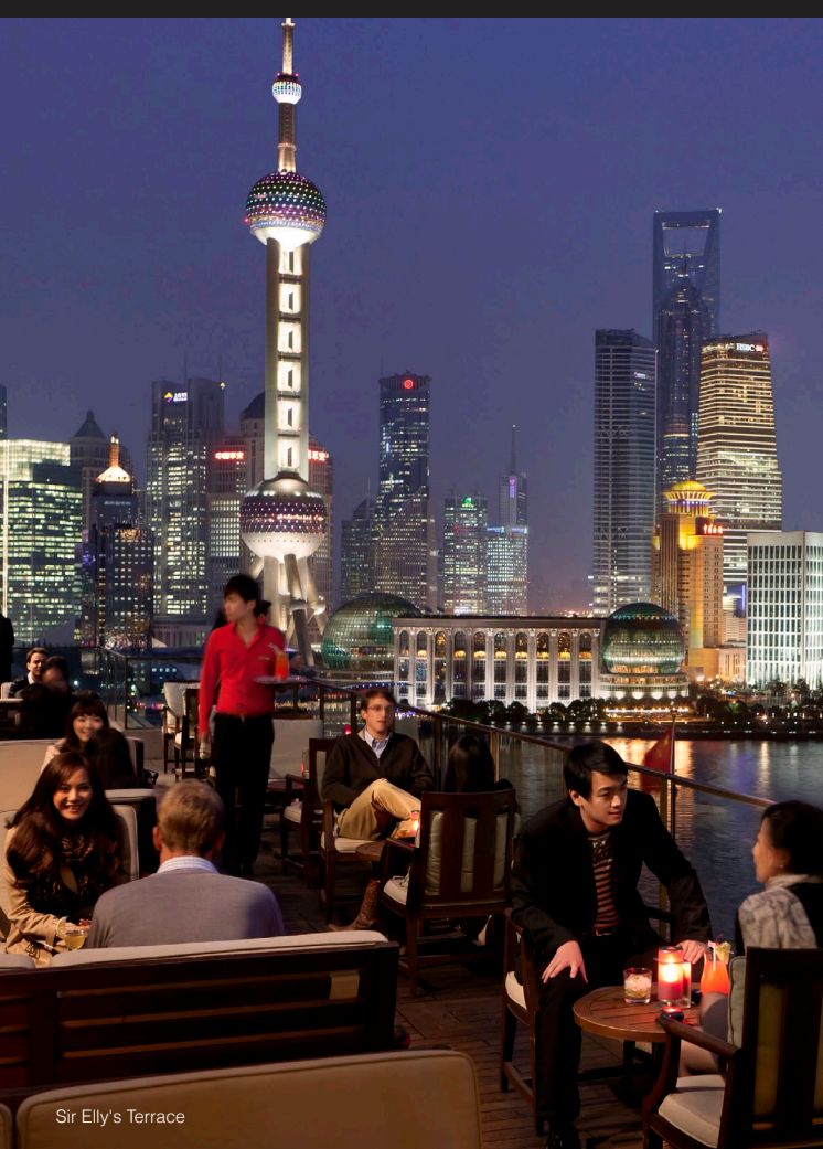
Sir Elly's Terrace